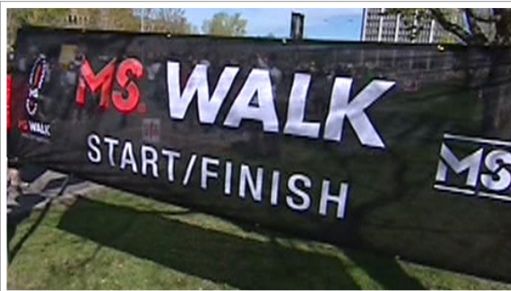
The annual MS Walk in Ottawa attracted more than 1,000 people and raised $340,000 for multiple sclerosis research, Sunday, April 25, 2010.